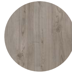
Smoked Oak 1009