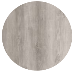
City Oak 1006