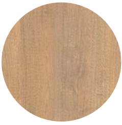
English Oak 1001