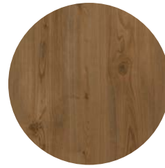
Heritage Oak 1008