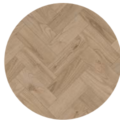
Loft Oak 2007