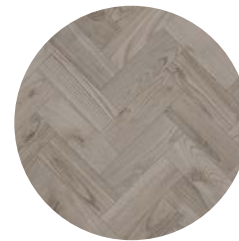
Smoked Oak 2009