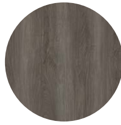
Shadow Oak 1003