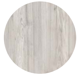
Arctic Oak 1005