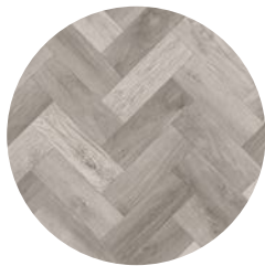
City Oak 2006