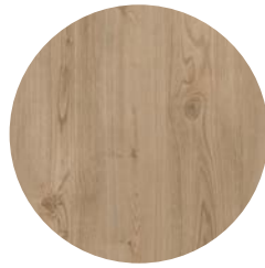
Loft Oak 1007