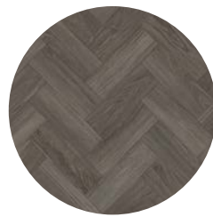
Shadow Oak 2003