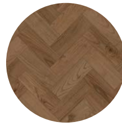
Heritage Oak 2008