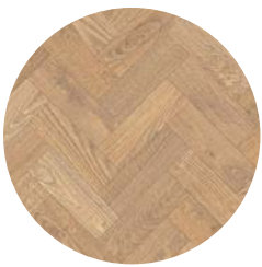
English Oak 2001