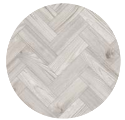
Arctic Oak 2005